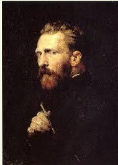
Vincent Van Gogh Impressionist Artist